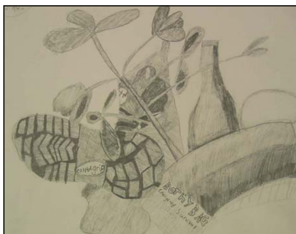
Still life by William Klein