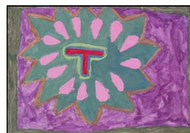
Pattern by Orlando Hill